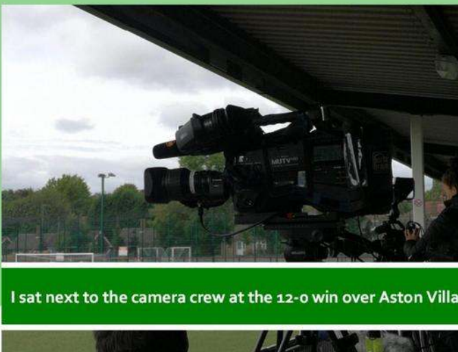
I sat next to the camera crew at the 12-0 win over Aston Villa