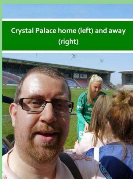
Crystal Palace home (left) and away (right)

To sum up this season, it would be one of immense pride, and one that I will never forget, and I am already looking forward to seeing what we get up to in the summer window, and then in the Super League!