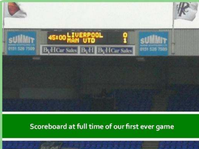
Scoreboard at full time of our first ever game

We had gotten off to the perfect start in the Continental Tyres Cup, but if I thought that was going to be our main highlight of the season, well I was in for a shock.